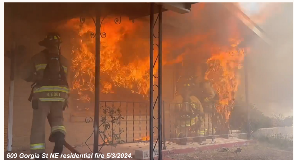
609 Gorgia St NE residential fire 5/3/2024.