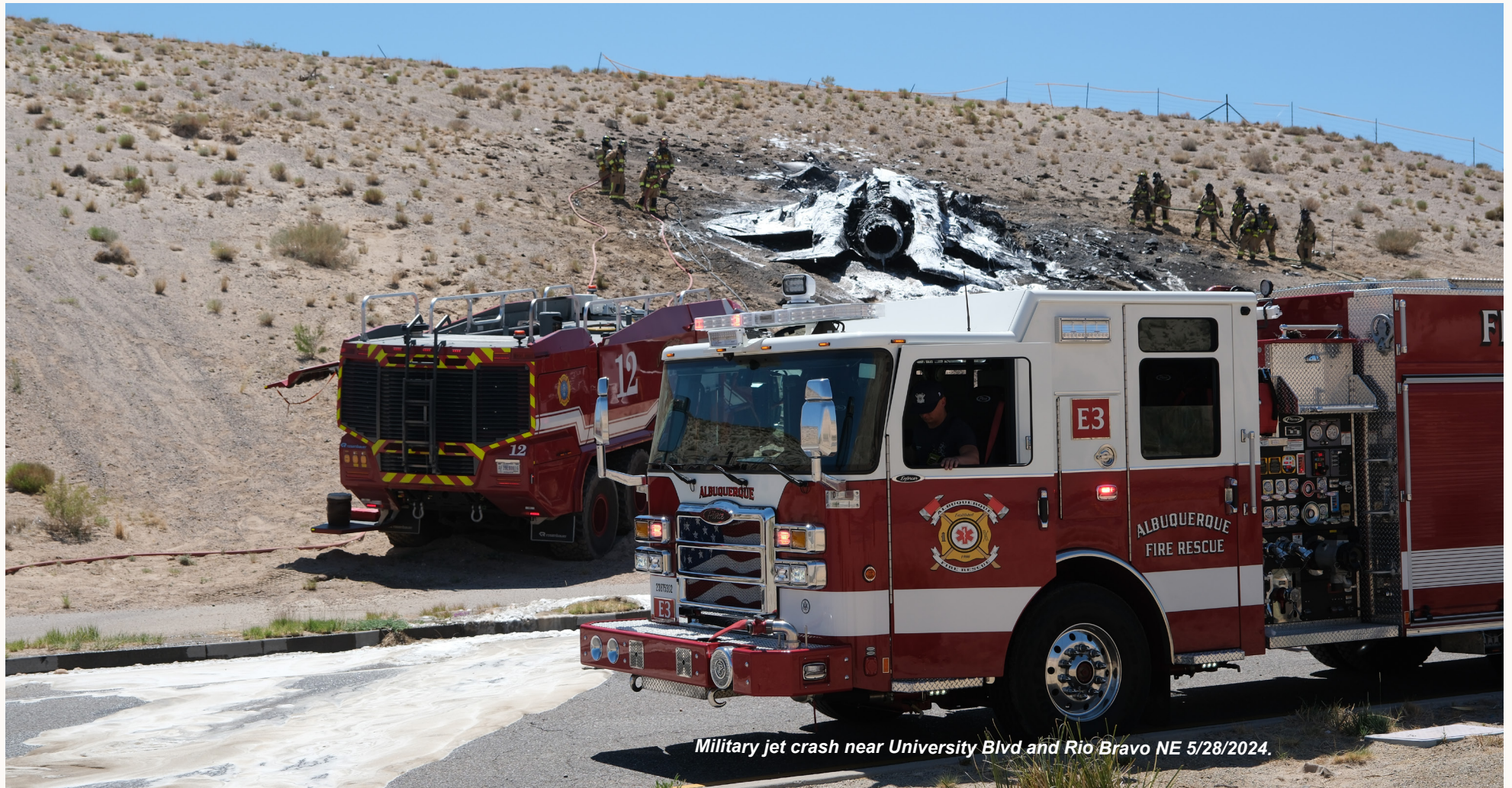
Military jet crash near University Blvd and Rio Bravo NE 5/28/2024.

Albuquerque Fire Rescue is transitioning to a completely new dispatch and CAD software. Call volume data will be delayed until next month but will resume with accurate year to date and current month numbers on the June monthly report.