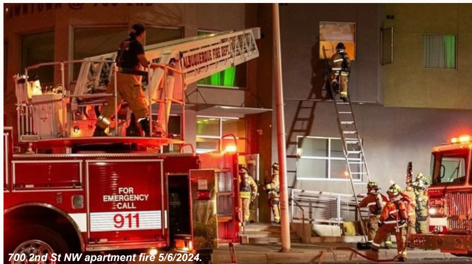
700 2nd St NW apartment fire 5/6/2024.

5/28 - Aircraft Crash: At approximately 1400 hours, Albuquerque Fire Rescue, Bernalillo County Fire, and Kirtland AFB FD responded to the area of University Blvd south of Rio Bravo for reports of a plane crash. BCFR Station 38 arrived on scene along with AFR's Battalion 1 and confirmed a downed aircraft that was on fire. Unified command was established, fire suppression efforts were initiated, and a search was conducted for the pilot. The pilot was located and transported to the hospital while crews on scene extinguished the fire. The scene was turned over to Kirtland AFB who transitioned into the investigation phase of the incident.