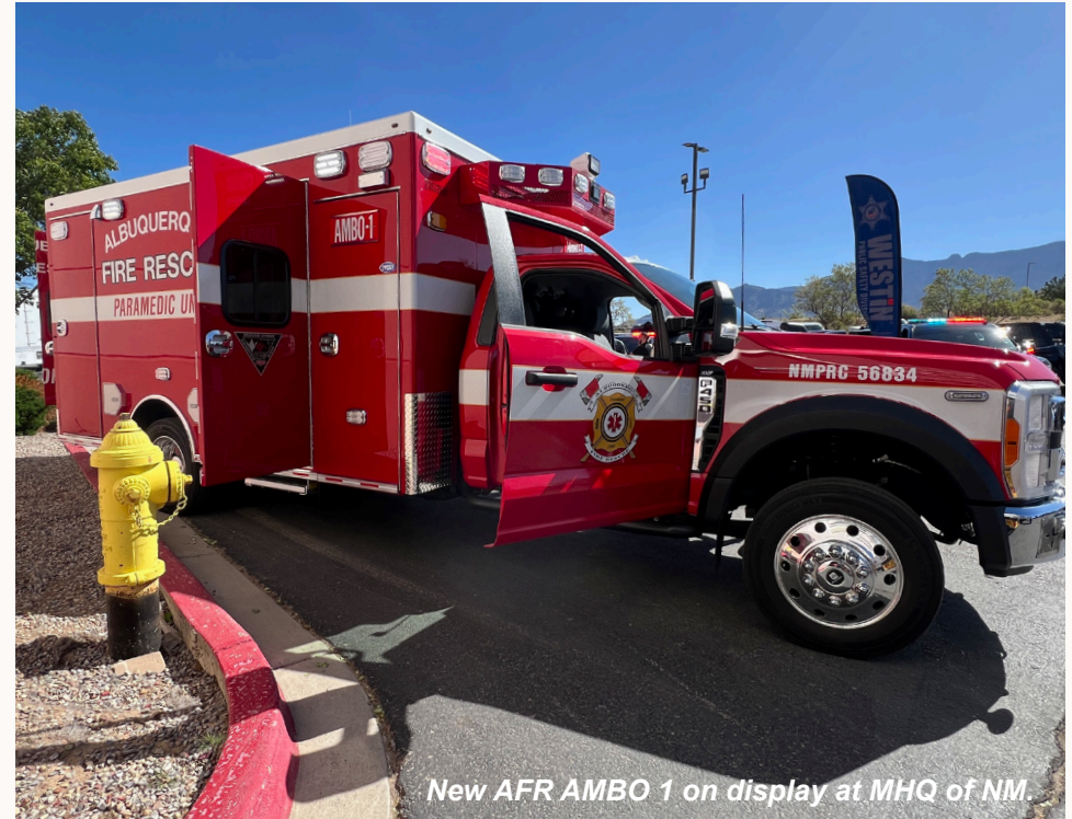
New AFR AMBO 1 on display at MHO of NM.